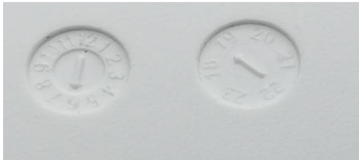
Date Code: Left Month - Right Year